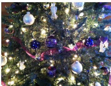
(Above pictures of CUMC taken on 12/1/2014,)